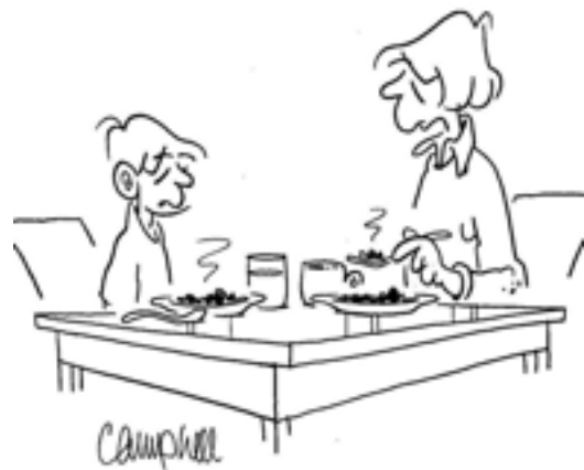
"These are vegetables, mother. You wouldn't want me to eat something I've given up for Lent, would you?"